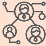
Designated Outreach Providers